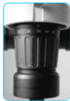
0.7~4.5X Zoom Body with detents