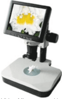
Video Microscope with HF Track Stand