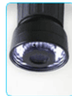
Build-in LED Ring Light