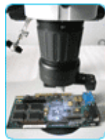
Laser pointer, easy to find the objective