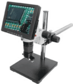
Video Microscope with Boom Stand