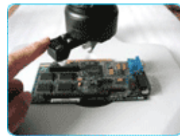
35° Angle 3D Attachment