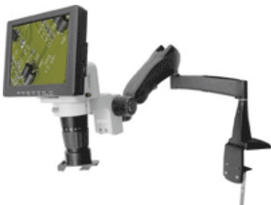
Pneumatic Arm Stand